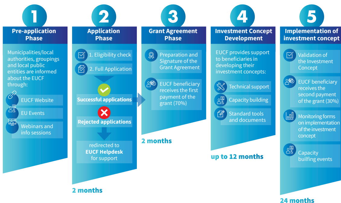
Example of the EUCF Roadmap for a call

It is really important that at the end of the process, each participant is informed of the final result and receives a feedback report , which will help applicants that were not selected to improve for the next call.